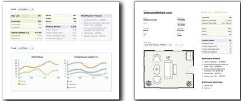
The 2020 Icovia Reporting Tool

Use the 2020 Icovia Reporting Tool to pinpoint which products your customers are looking at and how they've arranged their rooms – insights that help you market your products more effectively. Icovia helps you identify prospective buyers who visit your website and turn existing customers into repeat buyers.